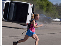
Crazy last moments caught on camera right before these unfortunate victims were taken by death.