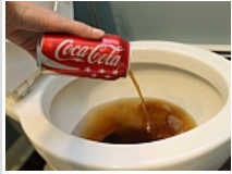
11 Cleaning Tricks That Make Your Life 100x Easier